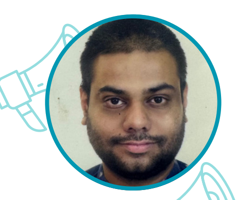
TM Akarshak T