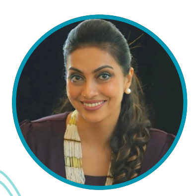
TM Binny A